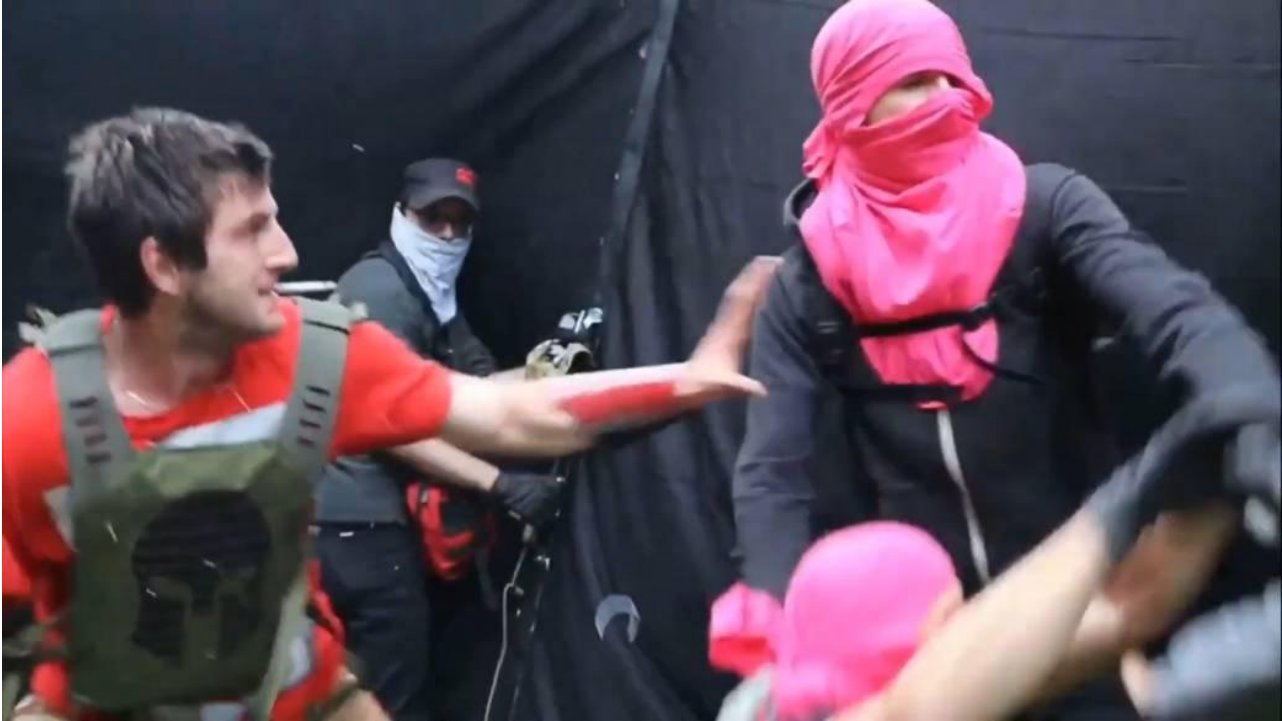
Police arrest suspect involved in Hamilton Pride altercation

The review is expected to be completed before Hamilton Pride 2020.