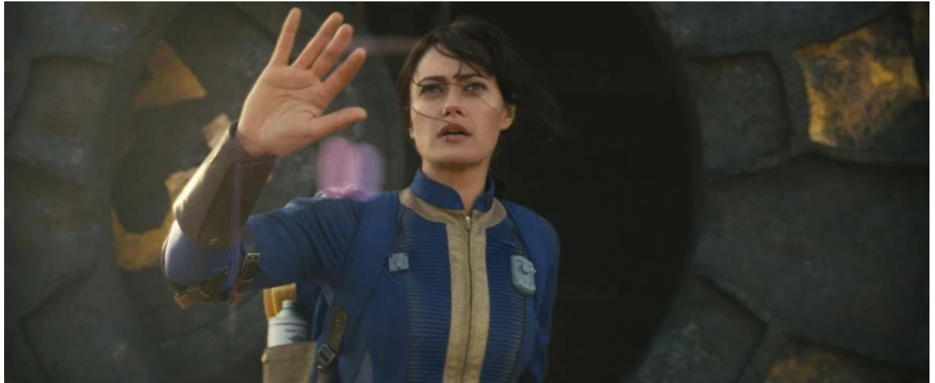
Ella Purnell in a scene from "Fallout."